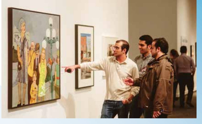
On Location: Artists Explore a Sense of Place Opened February 3, 2019 Organized by Glenbow Curated by Sarah Todd