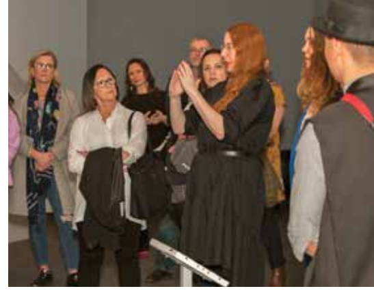
Salon Series evenings offer an intimate and insightful exhibition experience, where artists or subject matter experts give attendees an insider perspective on the ideas and work that go into the art.

Art Baby Tours give adults who care for young children a much-needed space to enjoy grown-up ideas in a baby-friendly environment. Attendance at individual tours has ranged from 8 people to 104 people (not including babies).