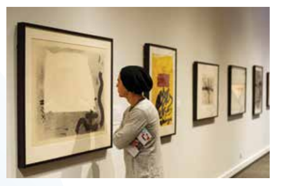
Antoni Tápies: Prints, 1948–1976 February 3 – July 14, 2019 Organized by Glenbow Curated by Sarah Todd