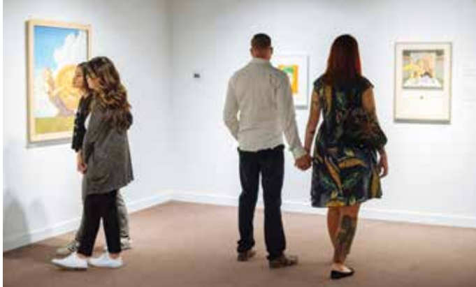
The Artist's Mirror: Self Portraits March 10, 2018 – January 6, 2019 Organized by Glenbow in partnership with Library and Archives Canada