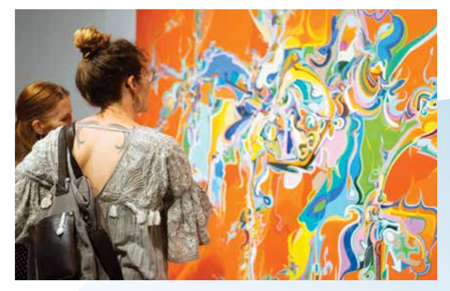
Alex Janvier: Modern Indigenous Master June 16 – September 9, 2018 Organized by the National Gallery of Canada