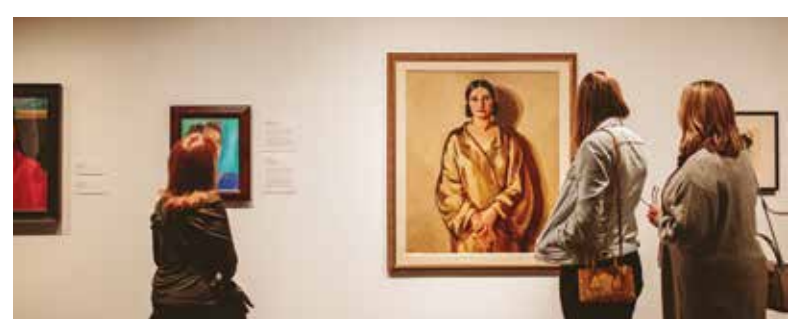
Ladylikeness: Historical Portraits of Women by Women March 8, 2019 – January 5, 2020 Organized by Glenbow in partnership with Library and Archives Canada