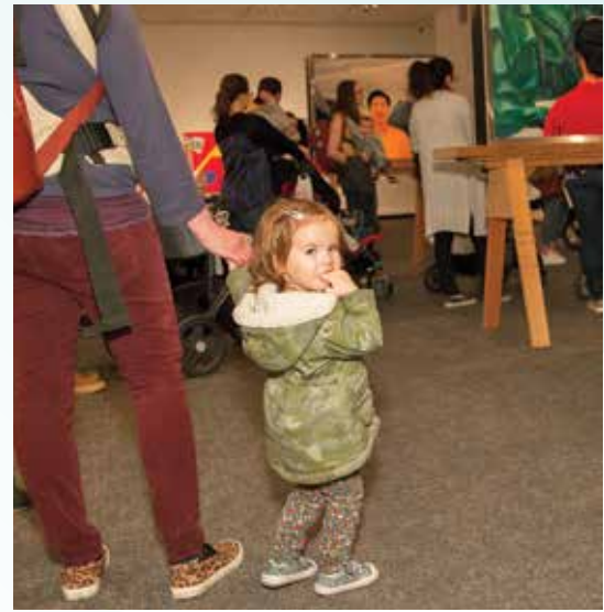
We believe art is truly for everyone, and the Discovery Room gives both children and adults a chance to relax and explore their own creativity.

Art Baby Tours give adults who care for young children a much-needed space to enjoy grown-up ideas in a baby-friendly environment. Attendance at individual tours has ranged from 8 people to 104 people (not including babies).