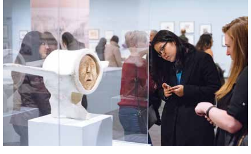
The Arctic: Real and Imagined Views from the Nineteenth Century September 29, 2018 - January 6, 2019 Organized by Glenbow Curated by Travis Lutley