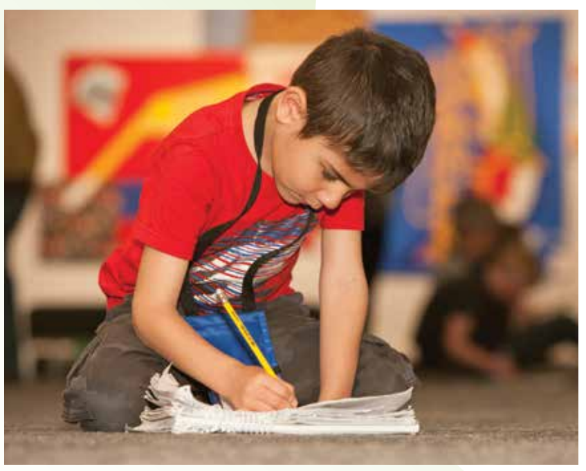
Whether students are encountering first-person stories told by Blackfoot educators, investigating a work of art or getting hands-on lessons in the science of the conservation lab, our education programs encourage them to think creatively and examine the world from different perspectives.