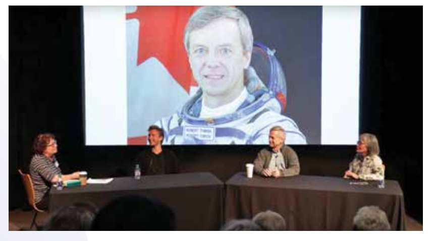
Audiences are invited to witness fascinating people In Conversation . We get a rare window into the life and ideas of the artists, curators and experts who inspire us with the work they do.

We added more Cocktails & Couture evenings to an already packed event schedule for the Christian Dior exhibition, as they repeatedly sold out. This elevated event paired fashion with the latest trend in bespoke cocktails.