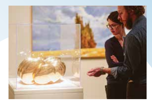
Recent Acquisitions 2017 June 30, 2018 – February 10, 2019 Organized by Glenbow