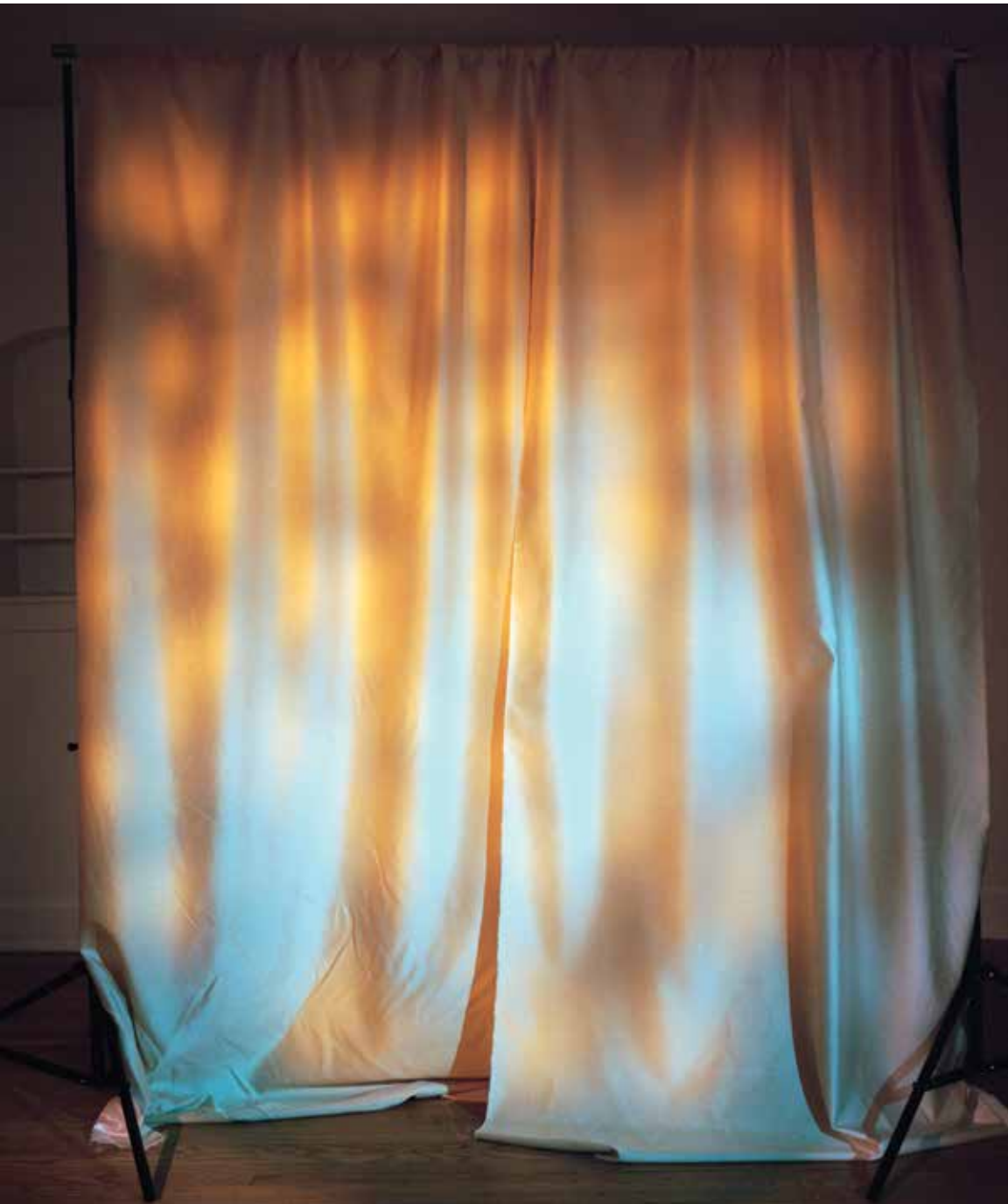
Nicole Kelly Westman, process photograph, 2017, medium-format film scan