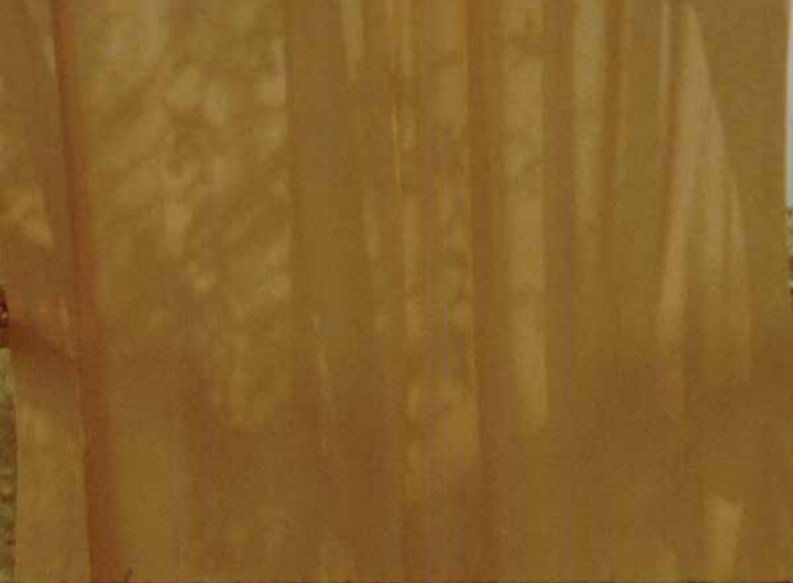
Nicole Kelly Westman, for every sunset we haven't seen (still), 2019, 8mm digitally transferred film, 7:15 minutes

and that loss is a condition universally felt. What sense these films make is existential and emotional; it is also resonantly personal.