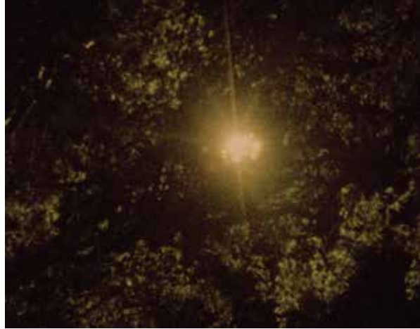
Nicole Kelly Westman, for nights bathed in sodium vapour (stills), 2019, 8mm digitally transferred film, 12:02 minutes

windblown canopy of a tree in a shot that swings more than 180 degrees to throw the world off balance. Then a tumult of images ensues like a fevered dream.